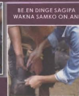
BE.EN DINGE SAGIPA WAKNA SAMKO ON.ANI