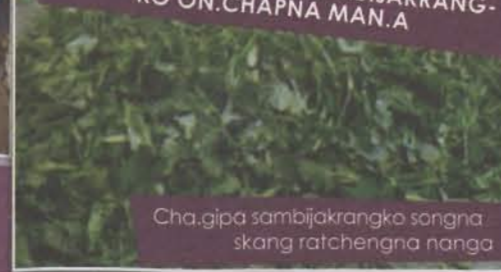
Cha.gipa sambijakrangko songna skang ratchengna nanga

WAKNI ALNI KOROSKO KOMIATNA GITA BURUNGNI CHA.GIPA SAMBIJAKRANG-KO ON.CHAPNA MAN.A