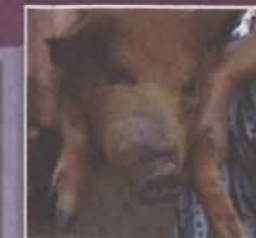
RHINITIS SAENGIPA WAK

VETERINARY DOCTORNI DAKCHAKANIKO TA.RAKE RA.NA GITA NANGA