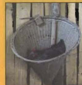
Do-bima bitchi chi-miting

Do-gringko megap ba cha·che done tarina gita nanga jekon pakmao setee donna gita man·a.