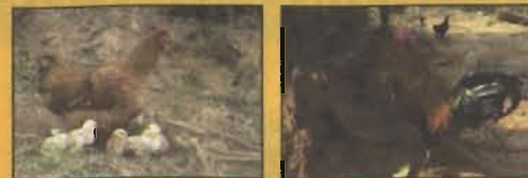
An-seng baljokgipa do-bima U syiar ryngkuh ba khlain