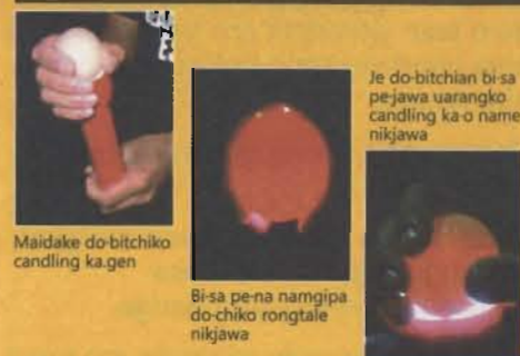
Maidake do-bitchiko candling ka.gen