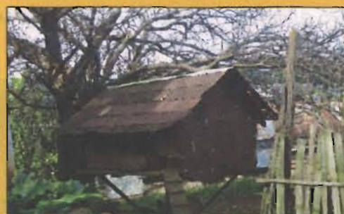
Noksa : Noksa: Tinni nokking aro bera chi rikgipa do-nol (Mawphlang block)

Dam komigipa bosturang jekai wa-a, bol, samsi, matchu ki-i chi repigipa pakma, polythene etc. rangchi rikna gita man-a