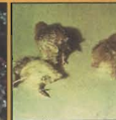
Pullorum sabisiko man-gipa do-bisarang