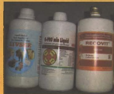
Vitamin aro mineralrang

Vitamin aro mineralrangko do-oni on·chapna gita nanga.