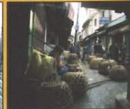
Mande jilgipa do.oko Iewduh, Shillongo palmiting.