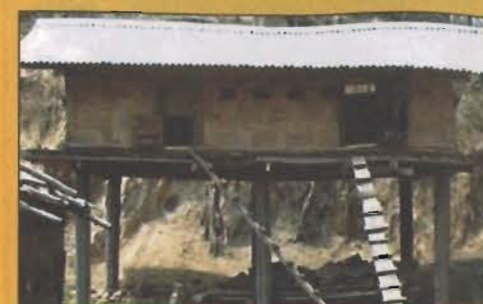
Noksa : Noksa: waseniko tarigipa bera aro tinci pingipa nokking jekon a-ani chue rika. (Garo Hills)

Saenggipa do-oko dingtang ma-ekate donna nanga.