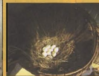
Do-o bitchi chi.chakna megapchi tarigipa do-gring

Do·bitchi chichakna tarigipa bolni do-gring