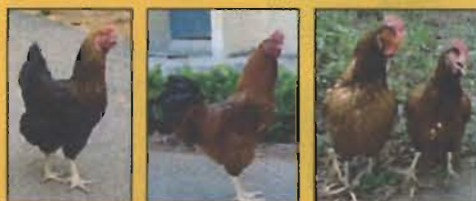
Gramapriya bipa aro bima

Namdatgimin jat jekai Vanaraja, Gramapriya, Kuroilerrangkoba jilna gita man.a.