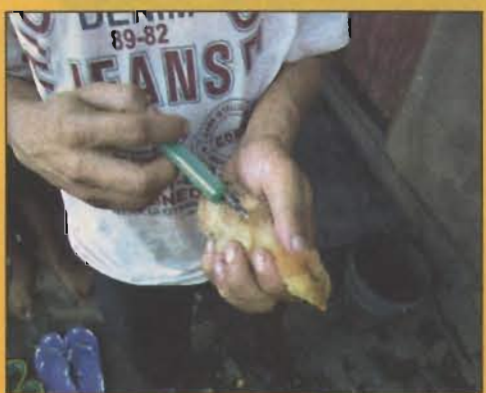
Noksa: Salsa ongipa do-o bi-sana saaniko champengna gita biji-ko suani.

Do-o bi-sako saoniko champengna gita biji su-ani.