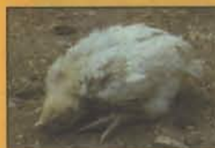
Gitok sakwelwele saenggipa do-o