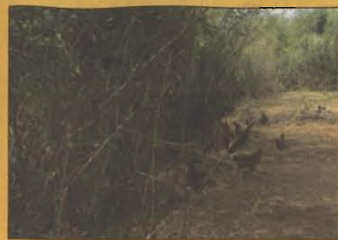
Do-orang buring samring cha-amenga