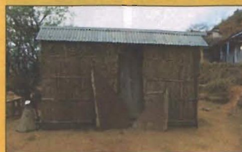
Noksa : Megap ni pakma aro nokking tin pingipa do-nol (Mawthraishan Block)

Dam komigipa bosturang jekae wa-a, bol, samsi, ampang aro polythene rangchi rikna gita man.a