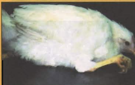
Ja.a jako mojimata man.ja