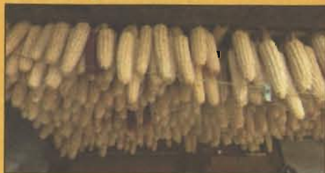
A-batango ge-gipa me-raku jekon do-orangna cha-na on-a gita man-a

Noksam nokgilo man·gipa cha·anirangkoba do-orang cha·na gita man·a.