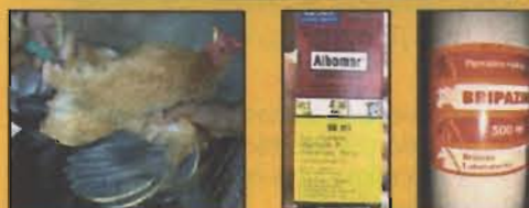
Sabisioniko champengna do-oko vaccinate ka-ani aro okni jo-ongko so-otani samrang:

Sabisiko champengani- Do-nolko rongtale rakkina nanga, chu-onga gita cha-ani aro rongtalgipa ringani chikosa on-nanga.