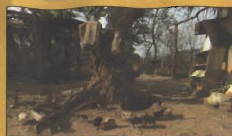
Noksa: Do-bima bi-sarang baksa cha-ramenga.