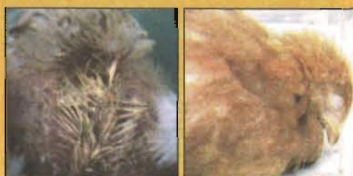
Gipoke ki-chraka Pullorum sabisiko man-gipa do-bisarang