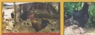
Chittagong Red Bipa

Namdatgimin jat jekai Vanaraja, Gramapriya, Kuroilerrangkoba jilna gita man.a.