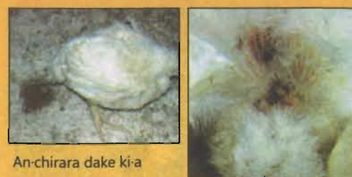
An-chirara dake ki-a

Sanani/Champengani: Coccidiosisni samko on·ani aro rongtal an·tale rakkiani.