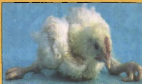
Curled toe paralysis

Champengani/sanani: chu·onga gita cha·aniko aro supplementrangko/cha·ani·o on·dapanirangko onna gita nanga.