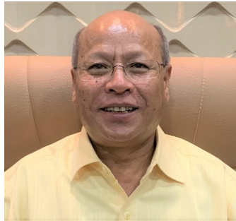
Shri. Prestone Tynsong

Hon'ble Deputy Chief Minister of Meghalaya i/c Animal Husbandry and Veterinary Department