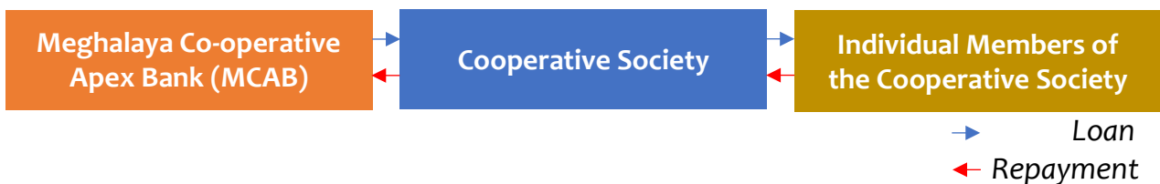
Figure1: Loan & Repayment Flow of Mission Components 4.1 & 4.2